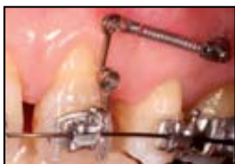
475 Bondable Power Arm