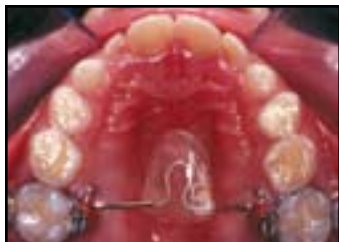
443 Vertical Control

The Cutting Edge column on data storage inspires this month's cover.